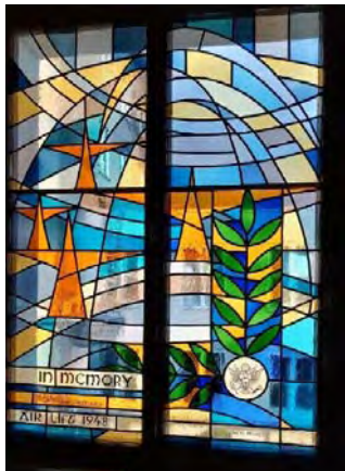
In Memory of the Air Lift 1948

Stained Glass "Unit" Windows are still in place: