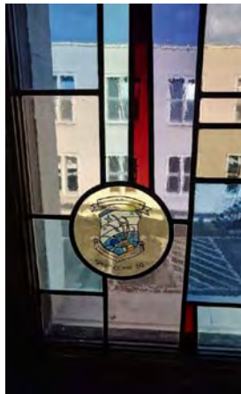
1946 th Comm Sq. window