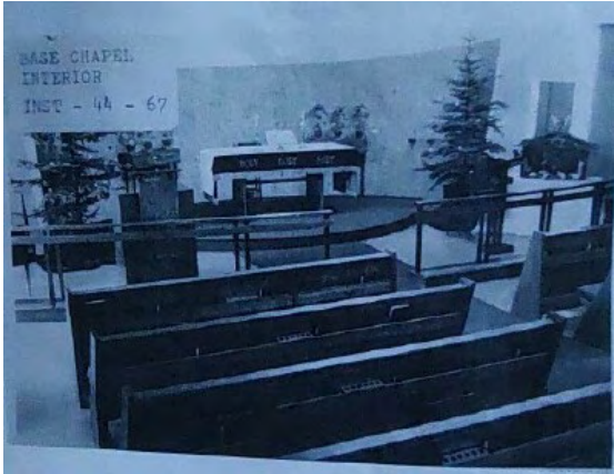
Base Chapel '44 – '67