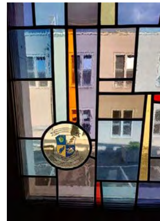
6912 th Security Sq. window