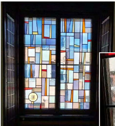
7350 th Air Police Sqdn