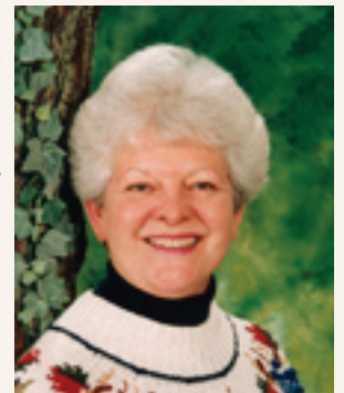
Faculty London Central 2007