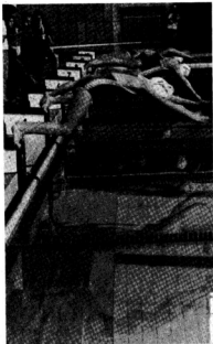
SEAL SKINNERS —The girls 15-19 age group individual medley was off with a shot in what was termed the biggest meet of the regular season for the Bear-A-Cudas, as they went up against the Seals from SHAPE at the Andrews pool Sunday. Berlin beat the Seals 220-198.

The Bear-A-Cudas travel to Patch Barracks Jan. 24 hoping to remain the European Forces Swim League's only undefeated swim team.