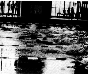
STIFF COMPETITION —On Sunday, the Berlin DYA Bear-A-Cudas met K-Town in the final meet in the season. The Cudas emerged victorious, 273-

135. The kids' next adventure will a Swim the Wall on April 10.