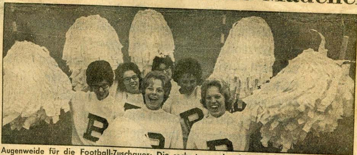
Augenweide für die Football-Zuschauer: Die sechs tanzenden Stimmungsmacher.

Sechs fesche und kesse Amerikanerinnen haben sich viel vorgenommen. Die kurzberockten Damen wollen im Olympia-Stadion am Sonntag für eine „Bomben-Stimmung“ sorgen — beim ersten großen Football-Spiel in Berlin. Ihre Devise: die Spieler anfeuern und die Zuschauer auf Hochtouren bringen.