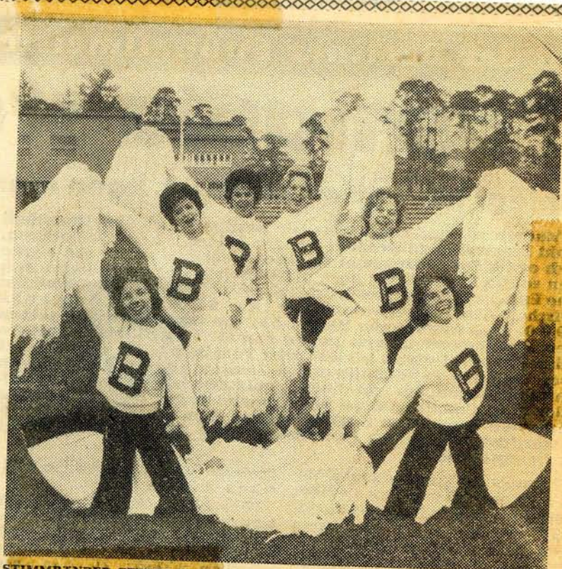
STIMMBANDER GEULT? Diese Girls sind die Stimmungsmacher der „Bears“.

► Aber auch schon vor dem Spiel und in den Pausen wird es ringsherum einiges Remmidemmi geben. Allein vier „illierte Militär- und die Berliner Polikapelle spielen auf. Der eigentliche ab- beginnt um 14 Uhr, das Vor- am um 13 Uhr 30. (DA)