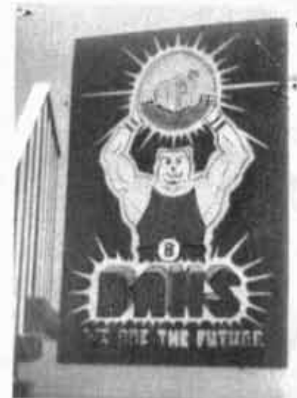
Mural over front staircase at BAHS

I had some Currywurst! How could something so simple taste so good? I wish I could take some home in my suitcase. I understand that Bier's Kudamm 195 is now the exclusive Currywurst address in Berlin - they sell champagne - Dom Perignon with their Currywurst. We left the city via the Kudamm and made our way towards the American sector in Dahlem. The PX and commissary on Clay Allee are gone. The Outpost Movie Theatre stands empty.