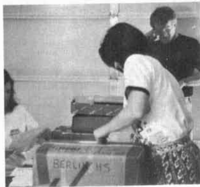
....opening box of BAHS memorabilia!