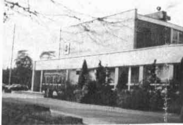
Berlin American High School

Friday, February 21, 1997... I'm staring out the window of my room at the Hotel Palace at the Europa Center. It's unseasonably warm out. I'm here at the Berlin Film Festival with Universal Pictures. We're having a special screening tonight across the street at the Zoo Palast of the newly-restored film VERTIGO . What should I wear? I still can't get my hair to do what I want it to.