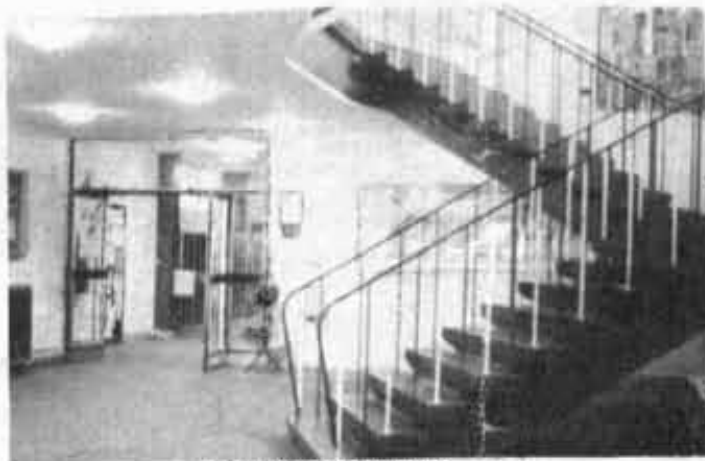
Front Staircase of BAHS