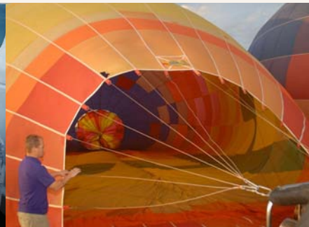
Balloons are Expanding and we wait excitedly