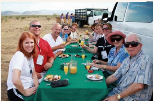
Champagne Breakfast in the Desert