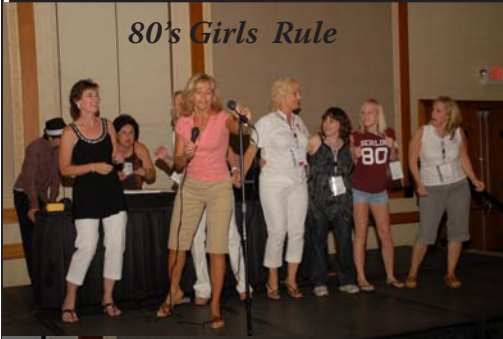
80's Girls Rule