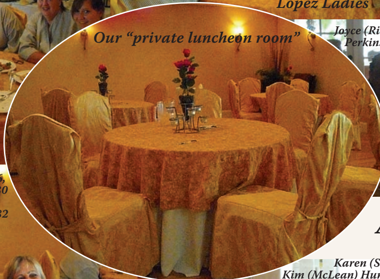
Our "private luncheon room"