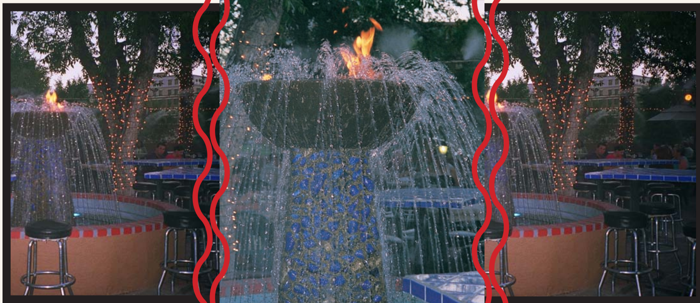
Fountain outside the "Old Town Tortilla Factory" in Scottsdale, Arizona where early arrivals had Mexican Buffet on Dutch Treat night

song lyrics by James Taylor come to mind