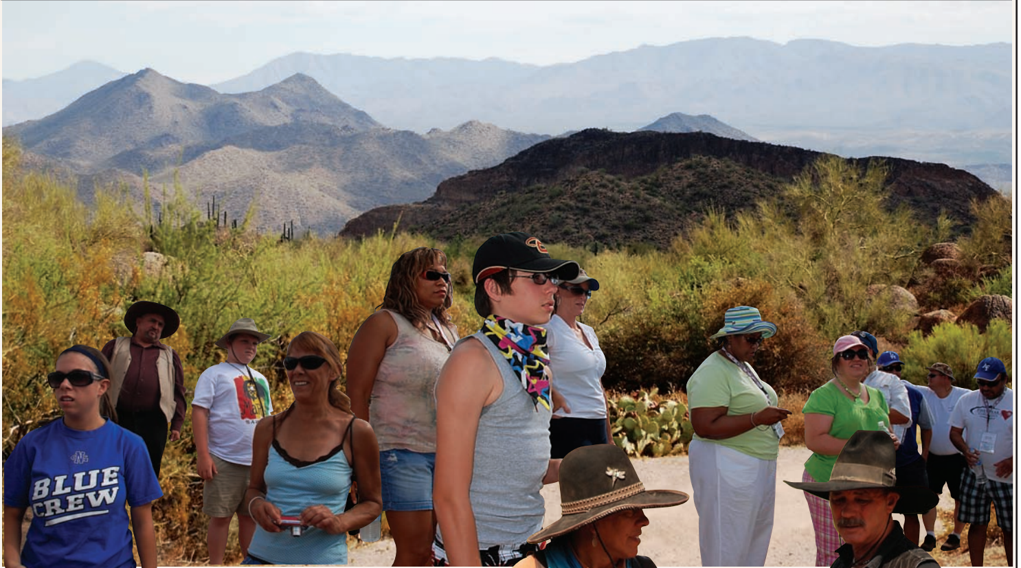
The Gang Trail Blazing.....