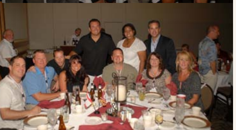
BAHS flags wave on the tables Saturday evening in front of these '80's attendees.