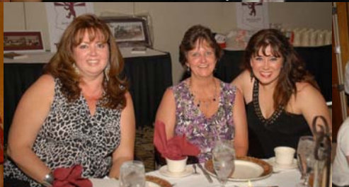
View the Silent Auction and Raffle Items behind these lovely ladies.