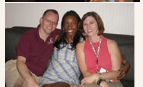
The Class of '87 had the most attendees. A close 2nd was the Class of '85