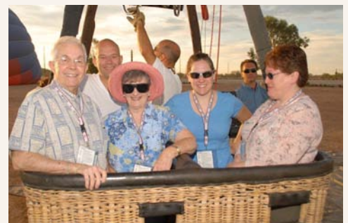
Ready for Lift Off