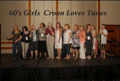
60's Girls Croon Loves Tunes