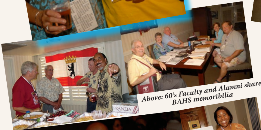
Above: 60's Faculty and Alumni share BAHS memorabilia