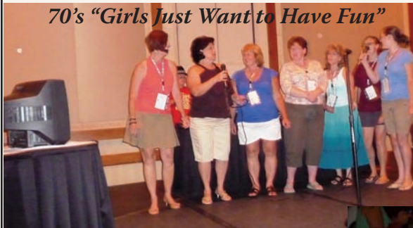
70's "Girls Just Want to Have Fun"